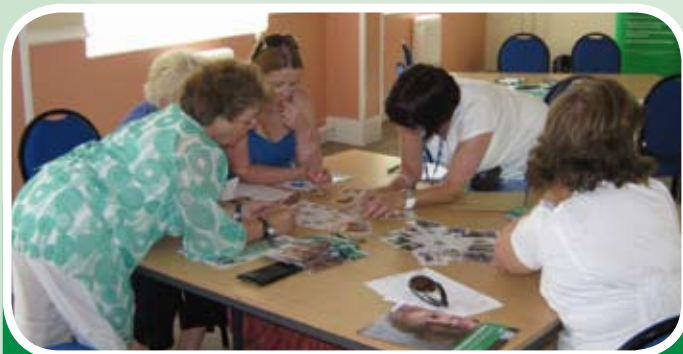
Some of the participants at a LINK event at Croxteth Community