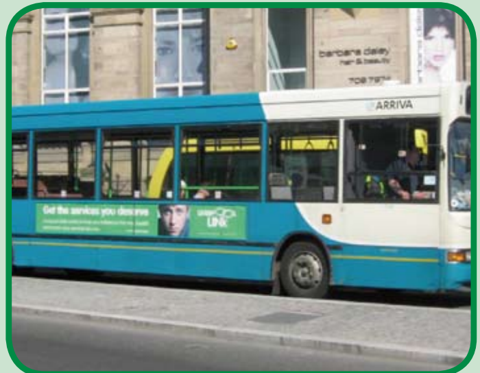
LINK advertising on a bus – spreading the word!

The new Core Group will take up their posts from the beginning of January 2010 following a handover / induction period. A Chair will also be selected in January.